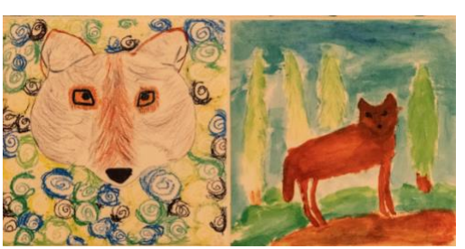
Ceramic tiles based on student art work