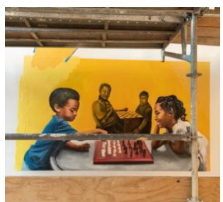
One of the murals