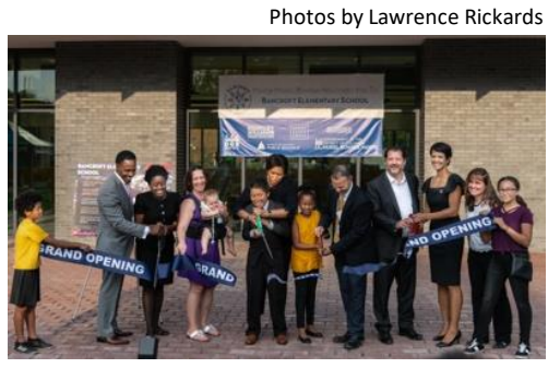
The Official Ribbon Cutting