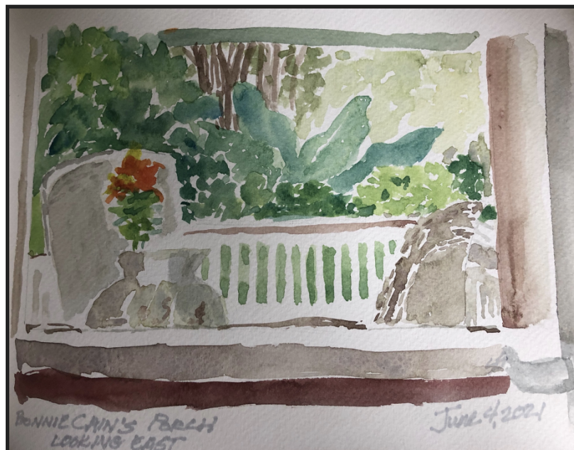
Bonnie Cain's Porch Looking East, watercolor on paper, by Villager Sheila Sontag