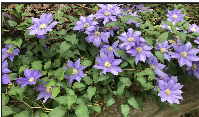
Villager Margaret Myers' gorgeous purple clematis in full bloom